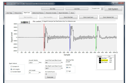
Right: Computerized fluid level recorded with Acoustic Fluid Logger IV software